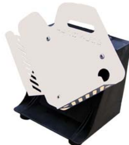
Table Top Jogger