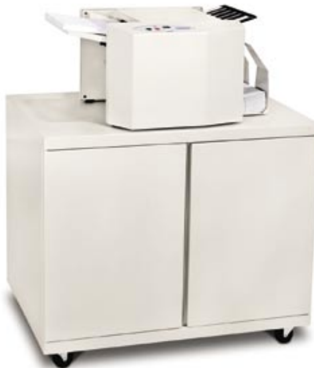
Shown with optional cabinet

The FD 1500 AutoSeal is The low volume folder/sealer solution for processing one-piece pressure sensitive mailers. Built with proven Formax technology, the FD 1500 provides an economical solution with the quality and reliability you have come to expect from Formax. The sleek office design and ease of operation makes this unit ideal for processing documents in an office environment with low volume applications. A processing speed of up to 85 forms per minute enables operators to complete daily processing jobs with ease. The added capability of processing 14" forms gives the FD 1500 the versatility needed to fold and seal virtually any low volume application to meet your needs.